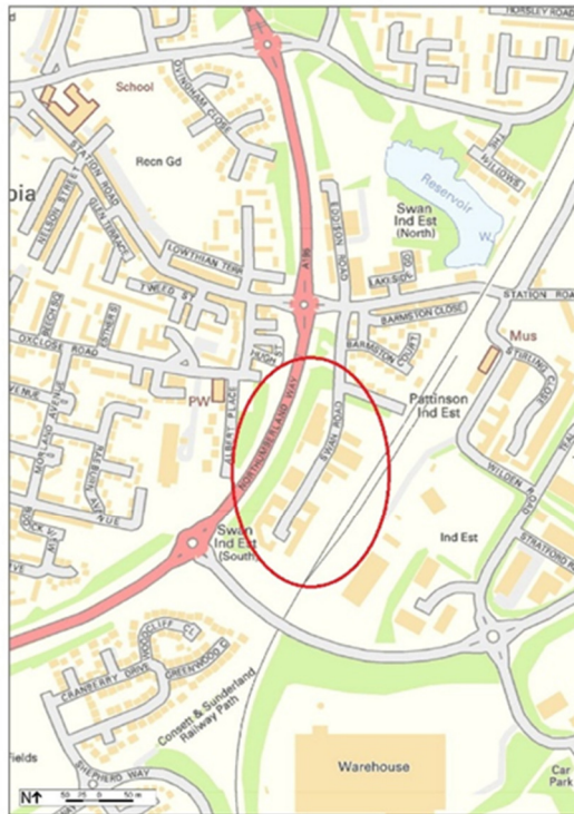
Swan Road, Swan Industrial Estate, Washington, NE38 8JJ

Map Information Scale 1:5658 Date 24/02/17 Reference Order No. 1803294