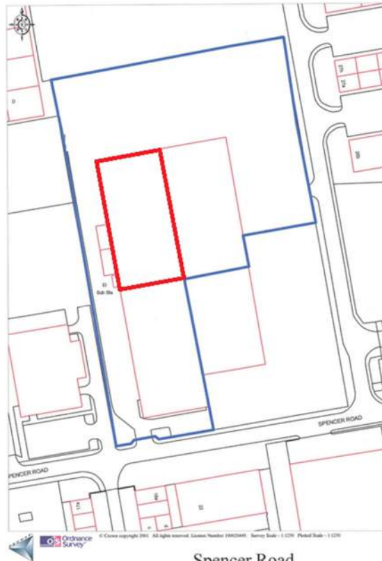
Spencer Road Blyth Industrial Estate Blyth