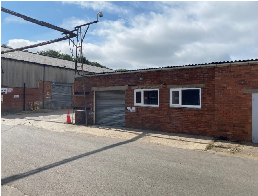
F492 Printed by Ravensworth 01670 713330